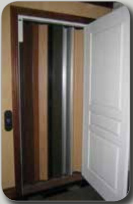
Solid Vinyl Accordion Gate