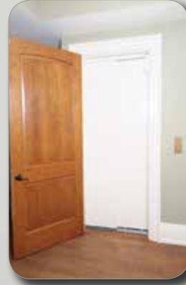
Custom Color Sliding Door (Optional)