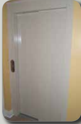
Beige Epoxy Sliding Door