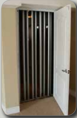
Visifold Accordion Gate (Optional)