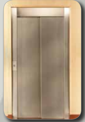
Stainless Steel Sliding Door (Optional)

Please refer to our "Options" brochure for a complete list of finishes and optional choices.