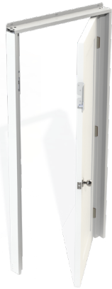
Finalized Look (DOOR NOT INCLUDED)