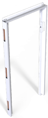
Flush Frame Front View

Cambridge Elevating’s new Flush Mount Landing Frame product ensures this requirement is easily satisfied.