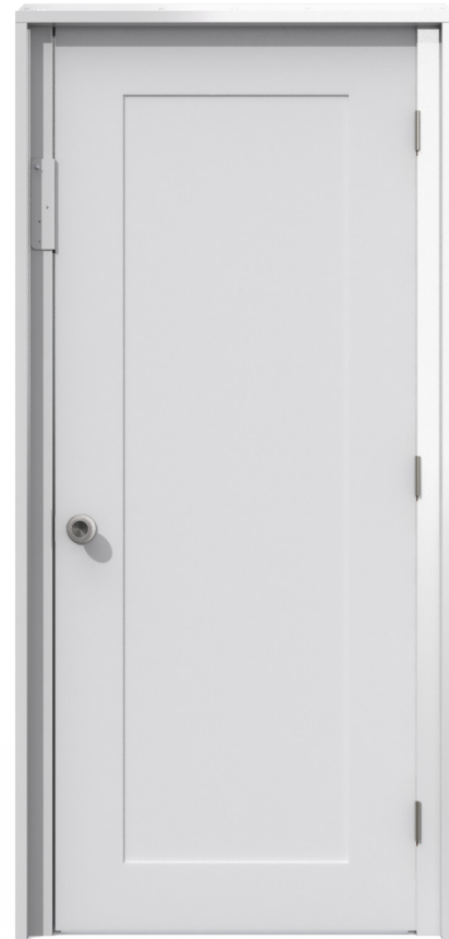
*DOOR NOT INCLUDED IN FLUSH MOUNT FRAME PACKAGE

Cambridge Elevating's Flush Mount Frames can be configured in both left and right handed orientations and are available in the following sizes: